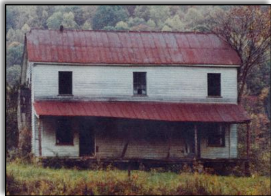
Rear addition and porch added to the original log cabin (undated photo prior to 1988 restoration)

The original log home was one story and had one room measuring 16 x 22 feet. A sandstone fireplace and chimney stood at one end of the room. Over time, the Ledford family changed the cabin in several ways.