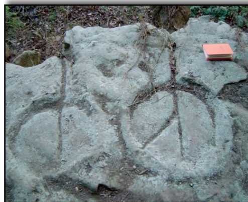
Pine tar kilns etched into large boulder

There are nine types of historic archaeological sites and standing structures. One type is residences, farmsteads, and communities, such as Gladie. Logging-related sites include dams used to move logs on creeks, animal pens for livestock used in the logging industry, loggers' houses and communities, and railroads used to move timber. Iron ore mining pits relate to the iron industry. Camps, bridges, and culverts occupied or constructed by the 1930s Civilian Conservation Corps are another property type. Others historic site types are niter mines, moonshine still sites, pine tar kilns, tourism and recreation sites, and cemeteries.